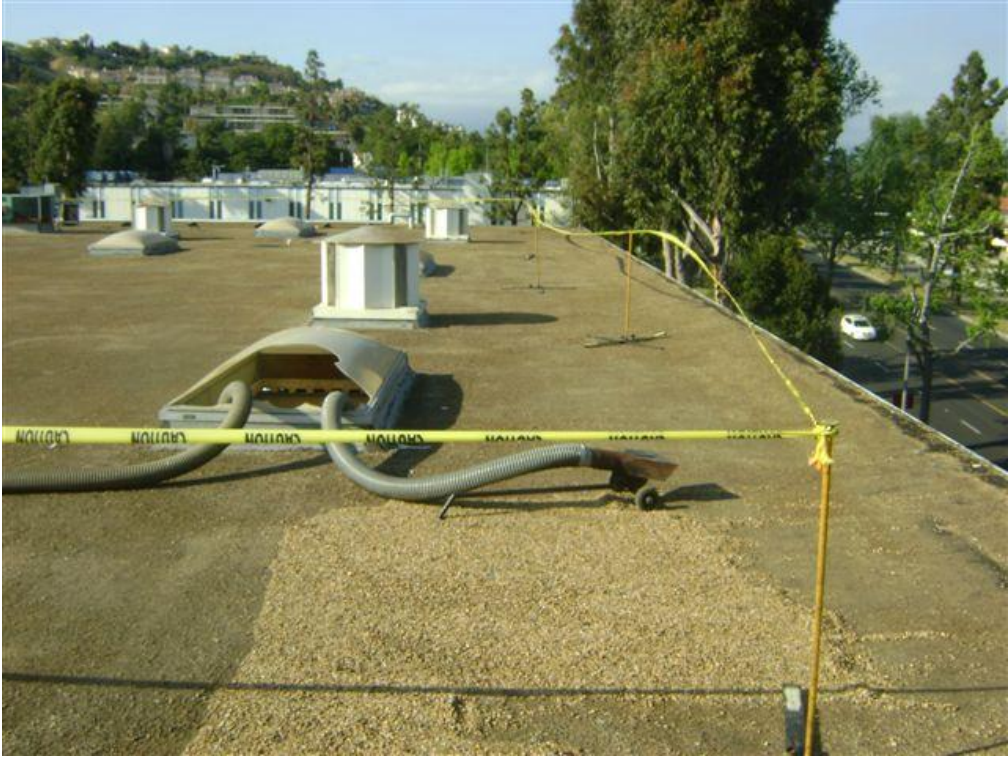
Exhibit 4. The incident scene.