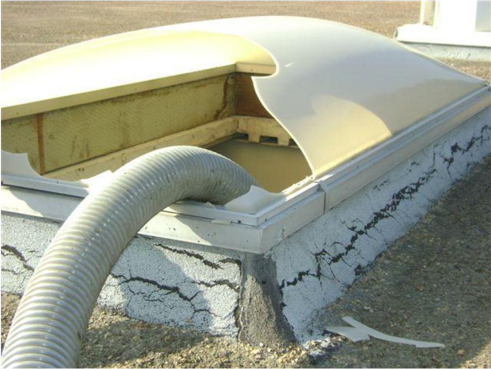
Exhibit 5. The base of the skylight.