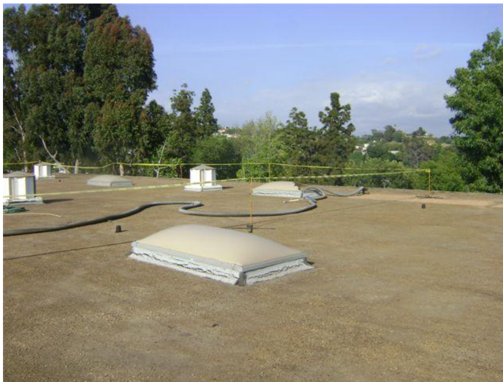
Exhibit 2. The work area on the roof.