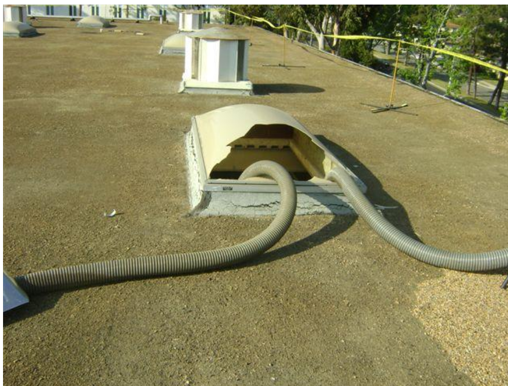
Exhibit 3. The skylight the victim fell through.