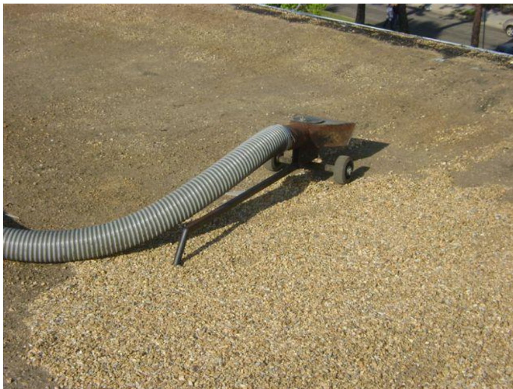
Exhibit 6. The vacuum nozzle.