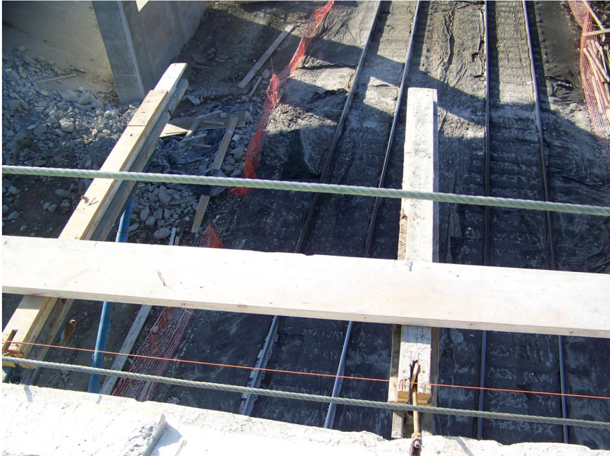
Bridge where worker fell from.

Kentucky Fatality Assessment and Control Evaluation Program Kentucky Injury Prevention and Research Center 333 Waller Avenue Suite 242 Lexington, Kentucky 40504 Phone: 859-323-2981 Fax: 859-257-3909 www.kiprc.uky.edu