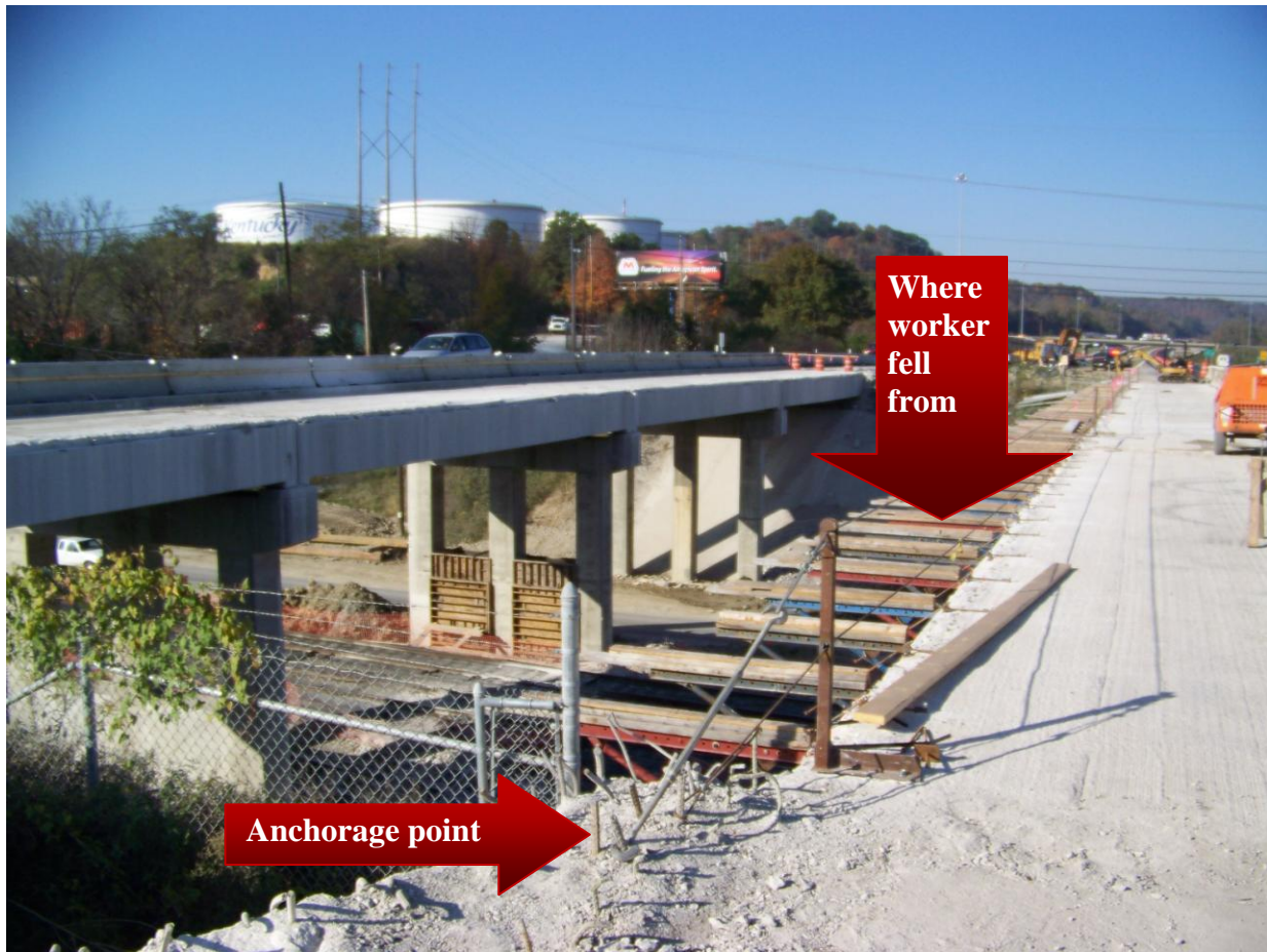
Photograph of anchorage point at east end of bridge and location where worker fell from. A 2"x10" board was across the jacks.