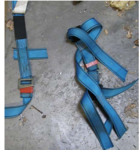
Harness cut from laborer

When the victim moved aside, he stepped onto two pieces of rotten plywood that were not nailed down, and the plywood pieces and unattached joist supporting them gave way. An investigation determined that his rope grab was attached near the end of his lifeline which left too much slack in the line allowing him to fall 30 feet to a concrete floor.